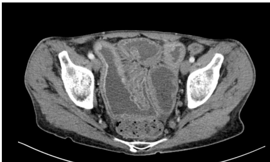
Figure 2 - CT with dilatation of small bowel loops and wall thickening of terminal ileus.