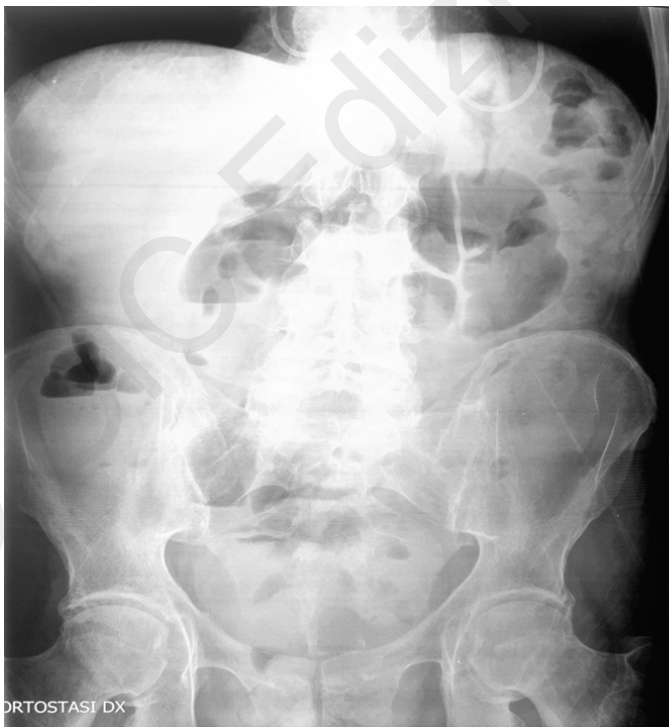
Figure 1 - Abdominal plain film X-rays with intestinal obstruction.

It has been proven that the risk of SBA rises significantly (3, 4) in Crohn's disease and some authors suggest it is increased more than 60-fold (7) as compared to the general population. Cancer affects the ileum twice as commonly as the jejunum and four times as commonly as the duodenum. The most frequent histotype is adenocarcinoma and its risk factors